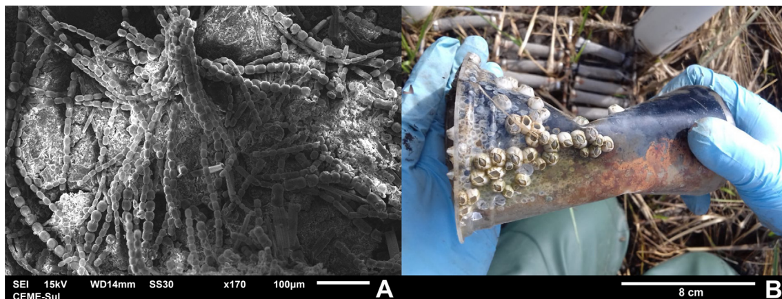
Fig. 2. A: Scanning electron microscopy of the surface of a microplastic particle (covered by gold), showing its rich microscopic biofouling community, mainly filamentous cyanobacteria. B: Macroplastic item (disposable cup) covered by algae and Cirripedia. Both plastic items were collected in the Patos Lagoon Estuary (Brazil). (For interpretation of the references to colour in this figure legend, the reader is referred to the Web version of this article.)

et al. (2014) showed that the percentage of Tripneustes gratilla larvae with microplastics in their stomach was higher when they were fed with non-fouled microplastics in comparison with fouled particles. They associated this with the behaviour of particle selection by larvae based on size, which was larger on fouled particles.