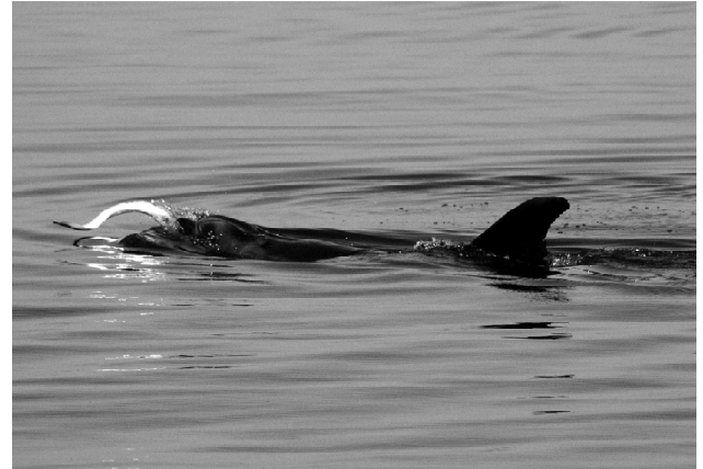
Figure 3. A similar episode, minutes later, same dolphin.