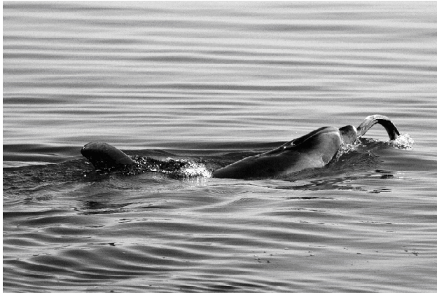
Figure 2. Bottlenose dolphin manipulating an European eel ( Anguilla anguilla ) before ingestion.