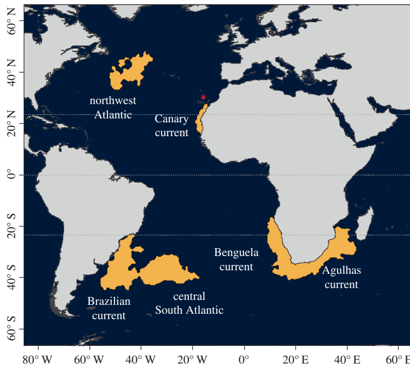
Figure 1. Winter distribution of Cory's shearwaters from Selvagem Grande (95% kernel density maps, from 57 individual tracks). Red asterisk indicates the colony location.

the activity patterns of birds during stopovers (percentage of time spent on sea surface and number of landings per hour) with those outside stopovers ( sensu [38]), using a bootstrap paired comparison design [39]. We were only able to analyse data during the southward migration, owing to the lack of latitudinal information during the return migration (see above). Activity patterns were derived from saltwater immersion data (wet/dry), registered by the geolocators with a 3 s precision.