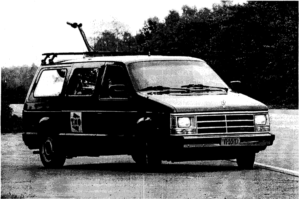
FIGURE 1 Instrumented Car for Computer Aided Driving ICACAD