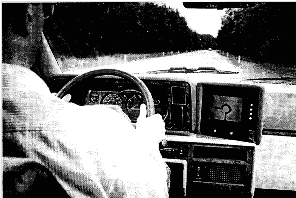
FIGURE 2 The common driver-vehicle interface has been extended with a multi-purpose hind-lit CGA Liquid Crystal Display with buttons

viour is registration of vehicle movements: there are sensors for lateral position (in the presence of road delineation), lateral acceleration, longitudinal speed, position and acceleration, and yaw and roll rate. Headway can be measured with an infrared radar or through a wireless dat link between ICACAD and another car that is supplied with the necessary equipment. Usually, the institute's other instrumented vehicle ICARUS (Instrumented CAr for Road User Studies, see Van der Horst & Godthelp, 1989) is used for this. For accurate position information on-line calibration of the current position is possible by use of active infra-red sensors which are triggered by reflecting material at given locations along the roadside.